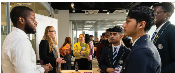
London Borough Of Newham, Apprenticeship Fair 2022

Over the next two decades, Newham will continue to act as a focal point for growth and investment within London. Together these developments are bringing new types of jobs and opportunities to the area in quantity and quality not seen here before, with a focus on securing long term growth and prosperity for future generations. In total, it is anticipated that 40,000 new jobs will be available by 2025, creating a cumulative economic value of more than £5 billion.