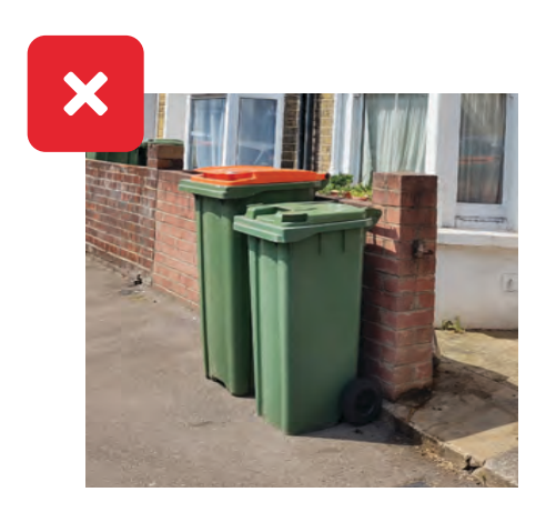
Not on the pavement