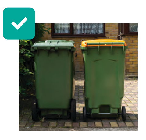
Handles facing towards the road, where possible

Waste collection services have changed for all residents who live in houses and houses split into flats. By bringing your bin to the edge of your property, you'll be helping our hardworking collection crews. Bins should be placed as close to the pavement as possible, for example, next to your gate, at the end of your drive. Please don't put them on the pavement. Crews will only now collect bins left at the edge of your property. So follow our guide and be bin day ready!