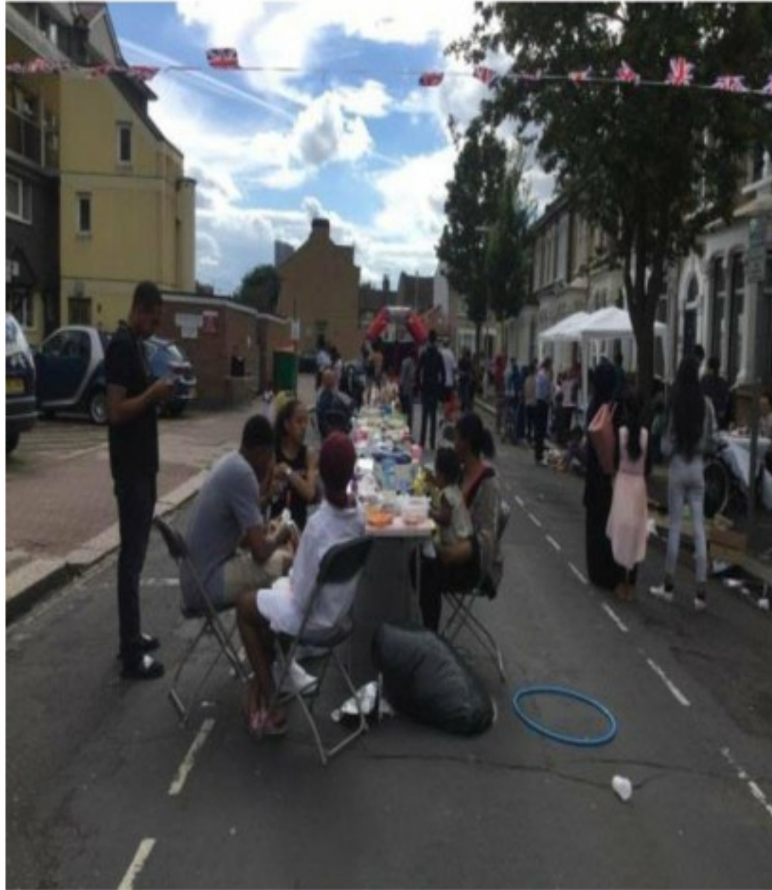
Street Party @ Shirley Street, organised by Newham resident