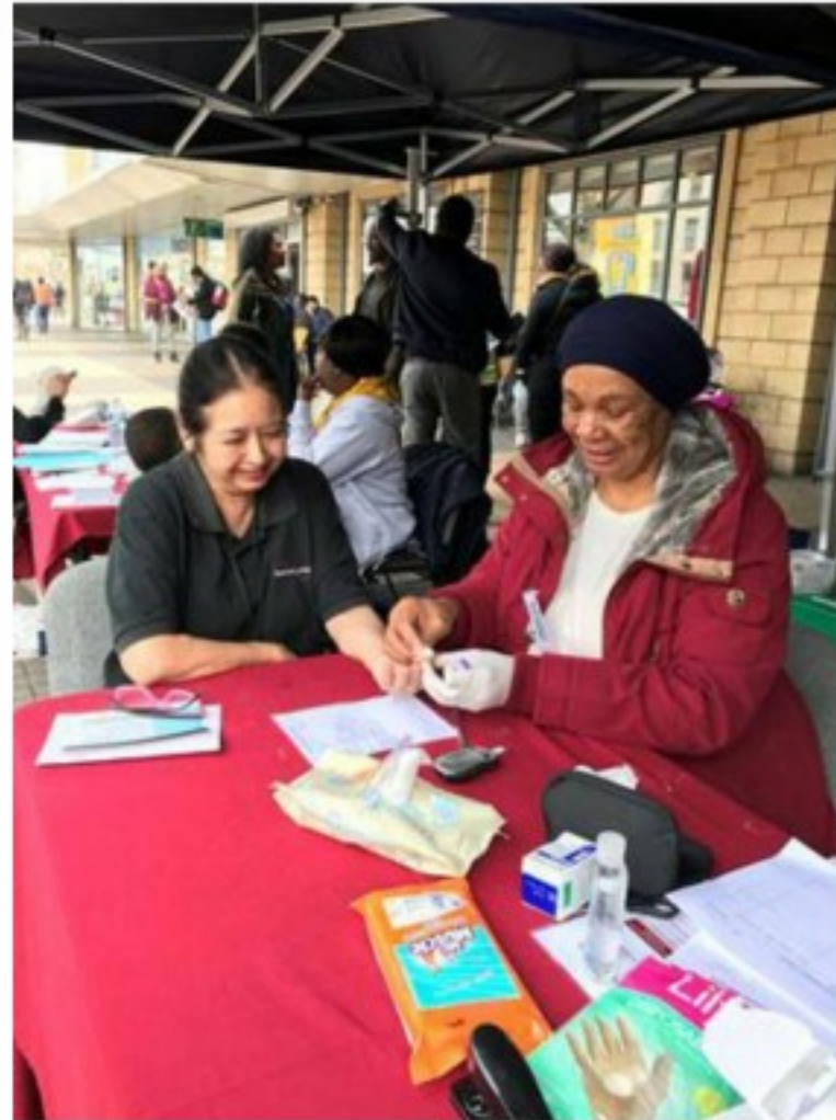
Health Expo by Seventh Day Adventist Church