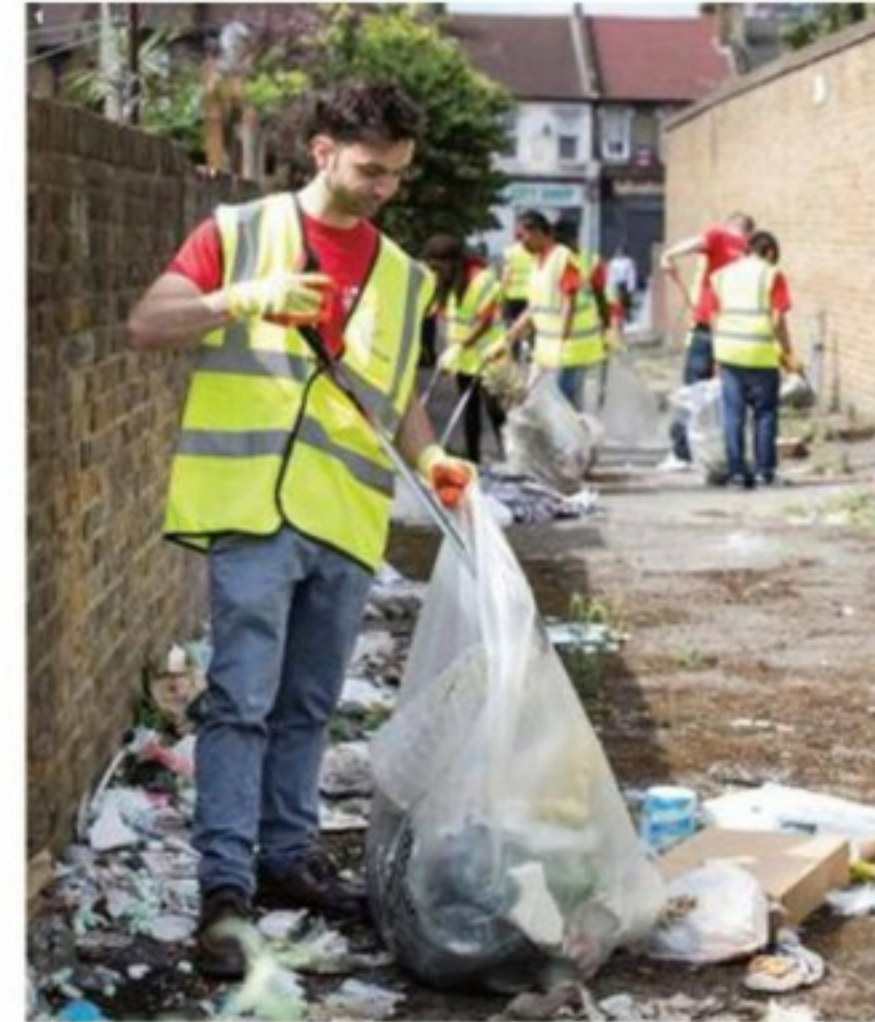
Community projects by local youth volunteers from Highway Vineyard Church