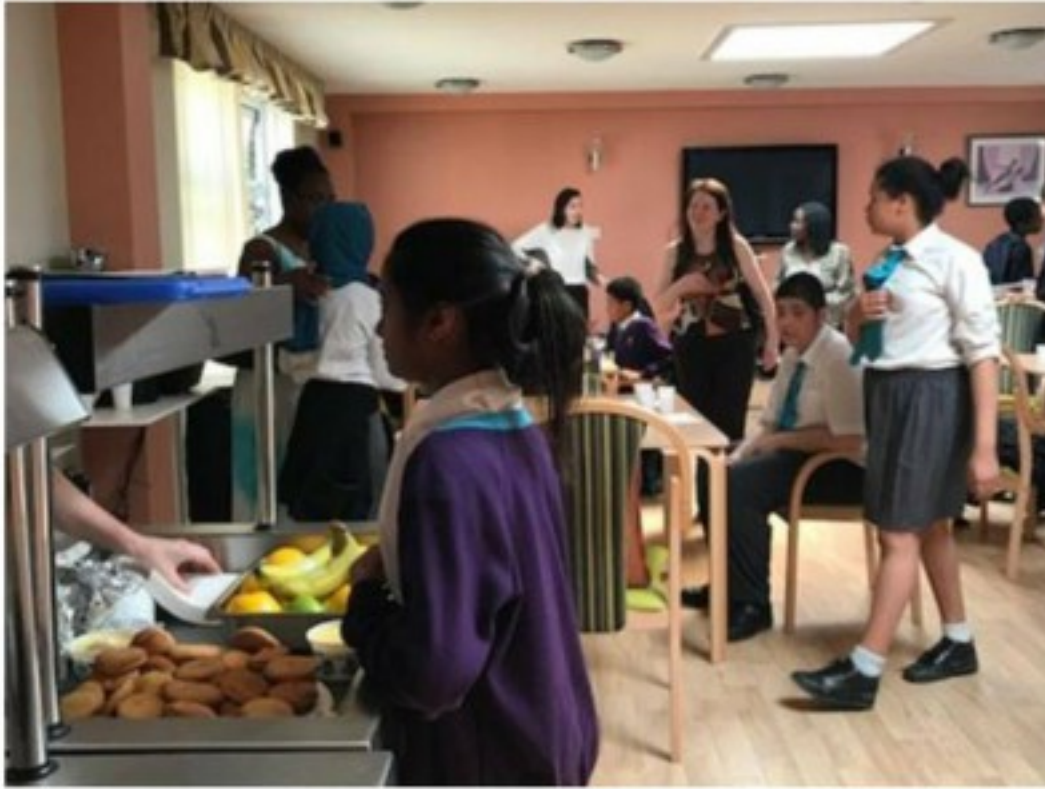
Intergenerational Café School 21 and Dementia Club