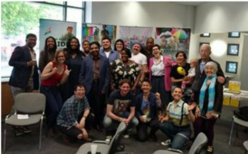
LGBT workshop (Embracing Diversity & Equality in Newham) led by Newham resident