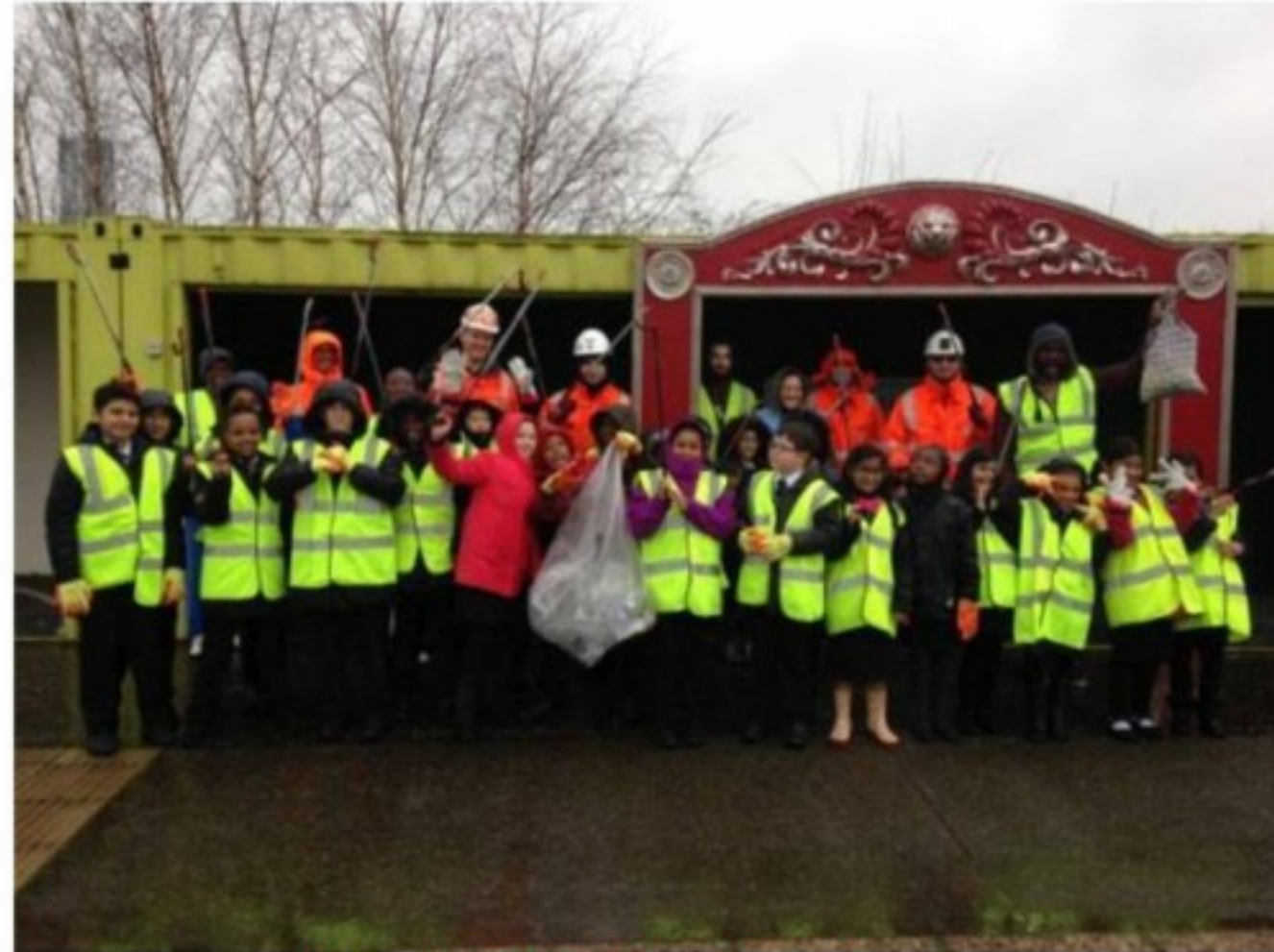
Litter Pick @ Newham Greenway with Newham school children