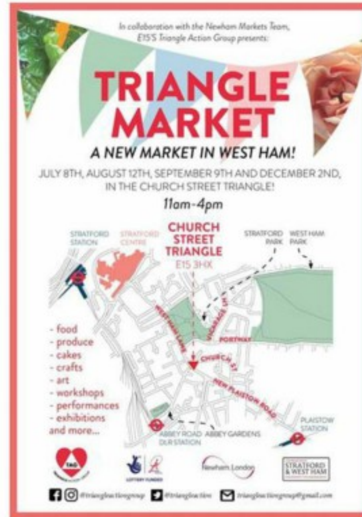
Triangle Market in West Ham, set up by local residents