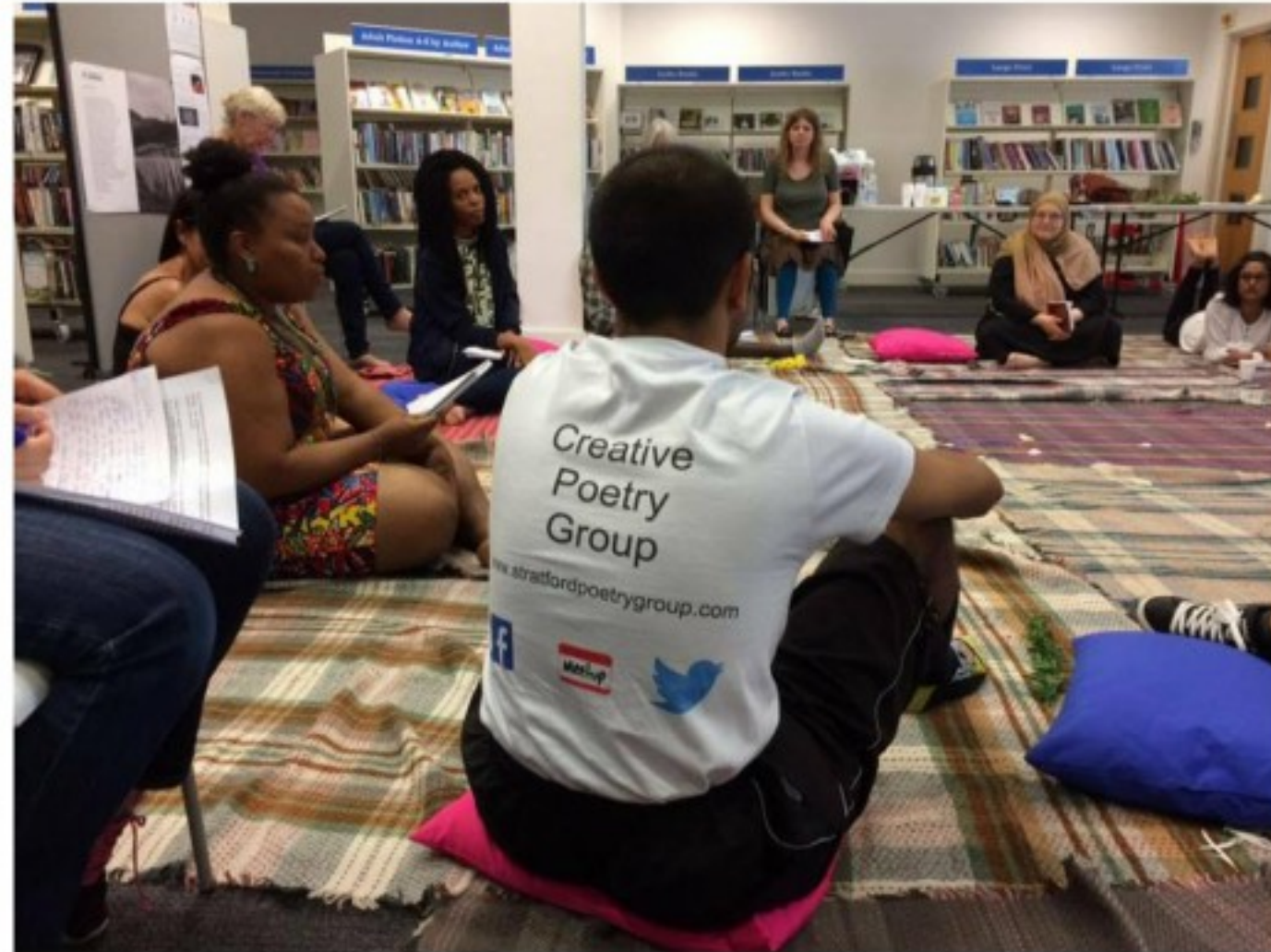
Stratford Poetry Group, led by Newham resident