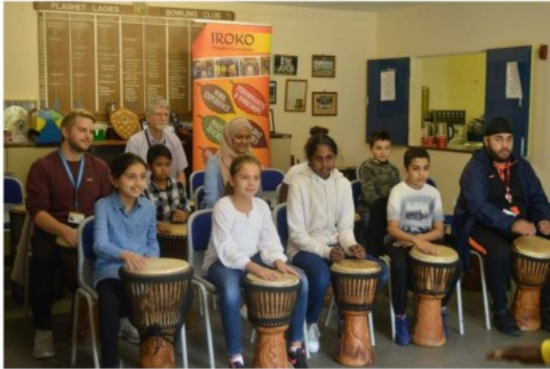
Iroko Theatre teaching Children as part of World Alzheimer's Day