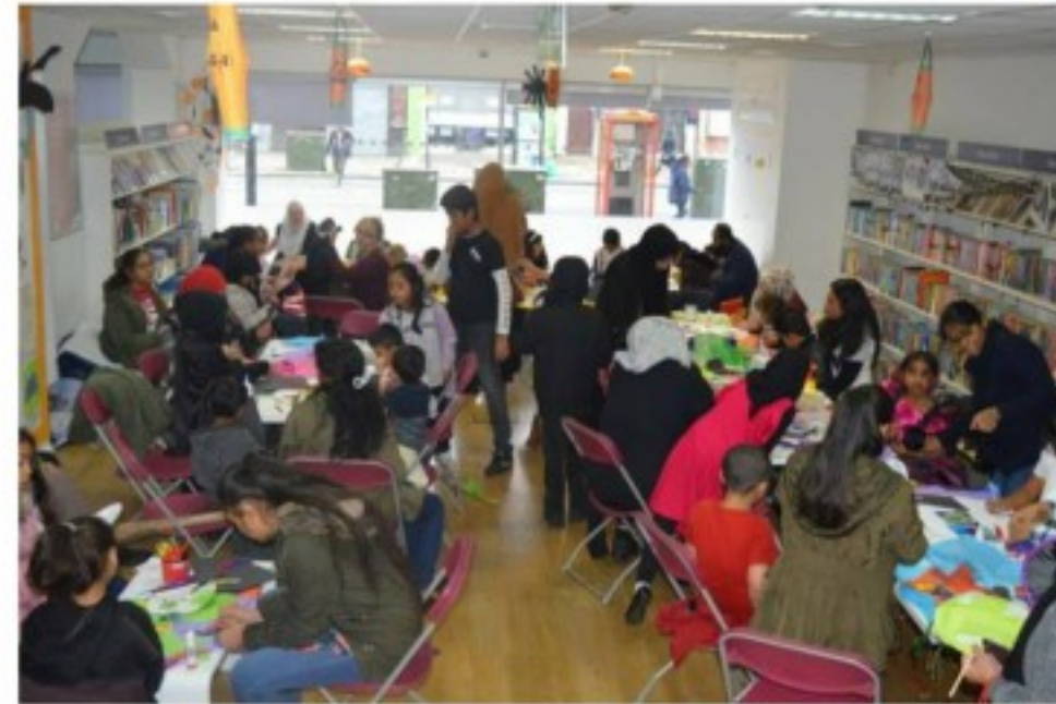
Craft and games activities in the Library as well a special one-off events