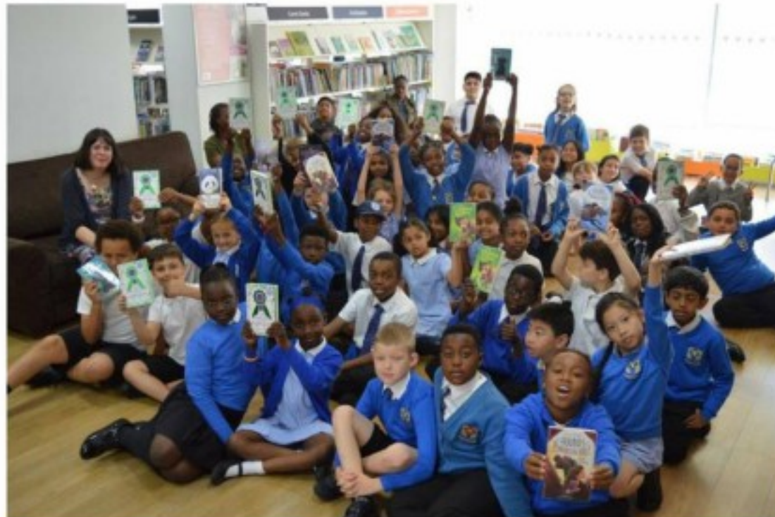
Author visits such as Holly Webb a leading children's writer