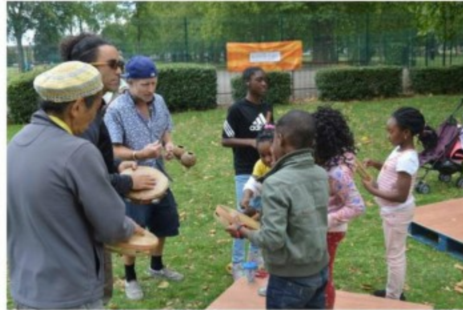
The Peace Stones Theatre Project a sculpture and performing arts initiative