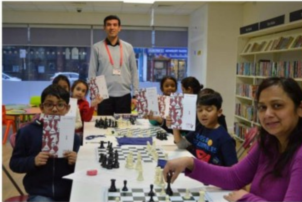
Two weekly Chess Clubs for children and adults