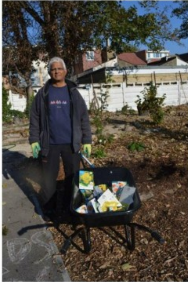
Volunteering opportunities through gardening