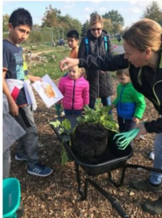
Little Grubs introducing children to environmental issues