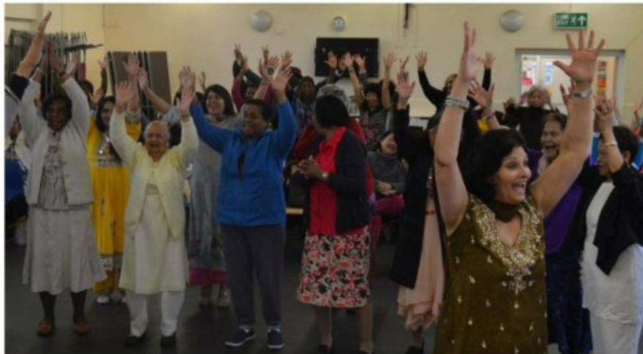
Each week the Community Neighbourhood delivers in the region of fifteen Get Active, Get Healthy projects for the over 55's in the Library, Plashet Park, and Jack Cornwell Community Centre