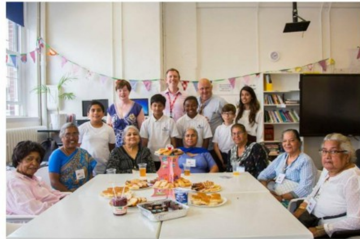
Kensington Cares an inter-generational project combating social isolation and building contacts