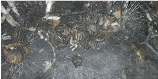
One of the latest major fires occurred inside a flat on New Orleans Walk in Highgate on 12 September. An e-bike caught alight inside a bedroom and its owner tried to put the fire out with an extinguisher. He sustained burns to several parts of his body as a result before firefighters attended and safely put out the blaze.