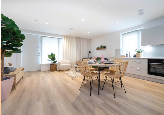
Left & below: Examples of completed Populo Homes in Newham

Homes can be adapted to meet your changing needs.