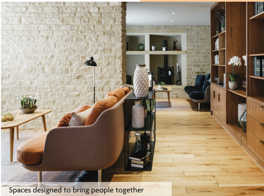
Spaces designed to bring people together

Below: Images are examples of similar and representative homes.