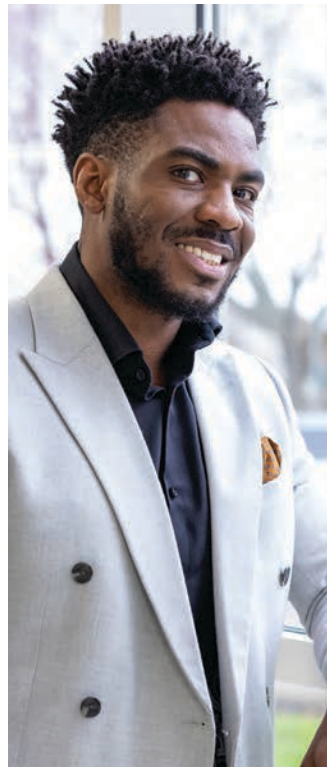
Paul Br8ke The Silence (B8TS) – Forest Gate & Maryland

“We’re teaming up with local community hubs to run 12 drop-in sessions that provide men with spaces to talk about their mental health. Through our sessions, we’re challenging the stigma of loneliness, which is often associated with masculinity, providing expert support for men looking to achieve good mental health and wellbeing.”