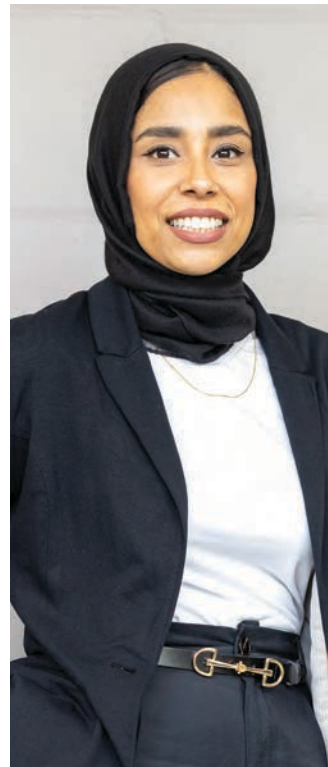
Sheba Be Safe, Feel Safe with Women and Girls Self Defence – Plaistow

“We’re working with our local community to combat fear and anxiety in women and young girls, and to increase their confidence. Our project provides women and girls with the tools they need to support their mental health and wellbeing, and protect themselves in a compromised situation.”