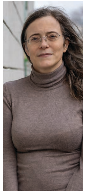
Celia Sustainable fashion and living + Newham's first Food Forest – Green Street

“We are establishing Newham’s first food forest at the Katherine Road Community Centre to create a perennial food-growing system. We will also teach annual food growing, food-waste reduction, run ‘Climate Kids’ sessions and fashion upcycling workshops. Our project addresses the climate crisis, bringing residents together in workshops focused on implementing good, sustainable practices.”