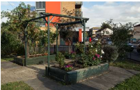
JACK CORNWELL COMMUNITY CENTER

We are also working with local men from Manor Park to start a Shed in the Jack Cornwell Community Centre – more details to follow.