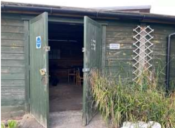
BREAKING GROUNDS SHED @ CHARGEABLE LANE

Our pilot shed is based in the grounds of Chargeable Lane Resource Centre , which has been converted to include a workshop and social area. Every Tuesday 12:00 – 16:00.