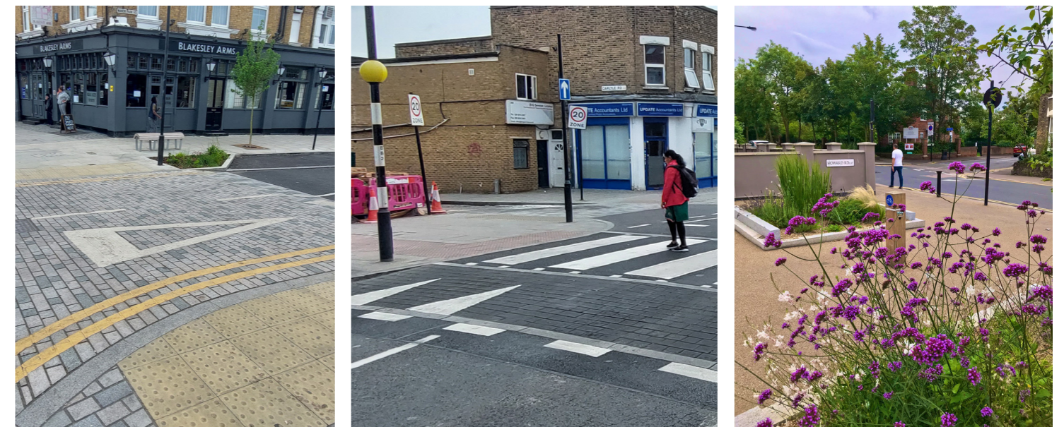
Examples of measures currently in place around Newham and Waltham Forest

If the Council decides to proceed with an experimental scheme, we will implement our proposed design to address through traffic, speeding and improve active travel. During this stage, we will continue to gather traffic and air quality data to measure the impact of the implemented measures. We will also collect feedback from residents, businesses and other groups to help us decide whether or not to make the scheme permanent before the 18 month period.