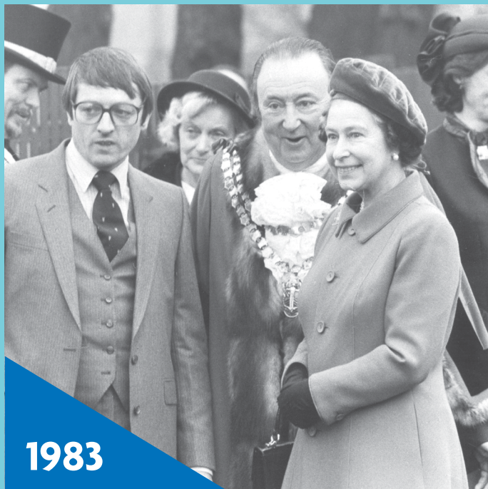
Top left: East Ham Nature Reserve