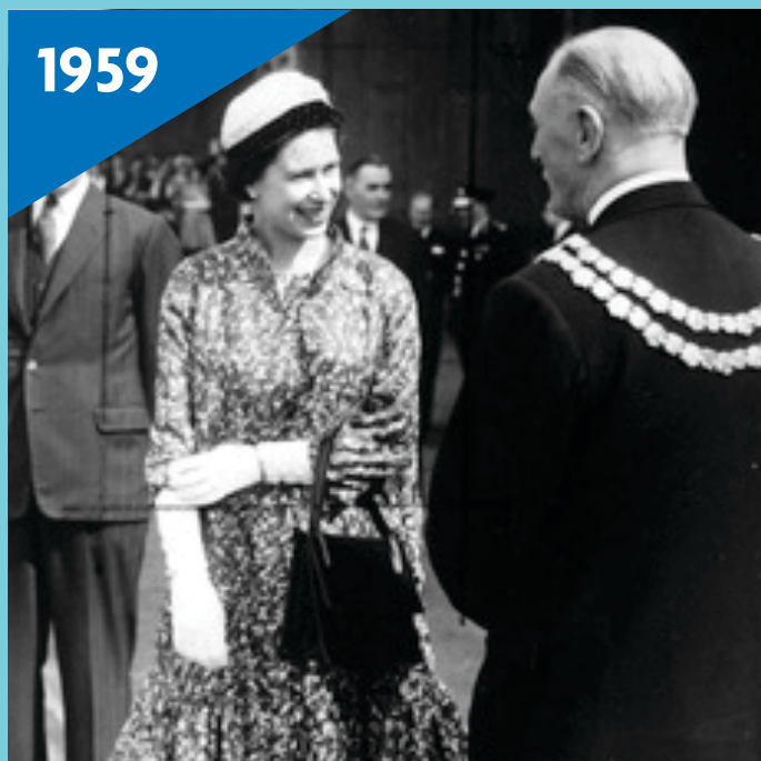
Top right: Queen & Mayor of Newham, Constance Bock