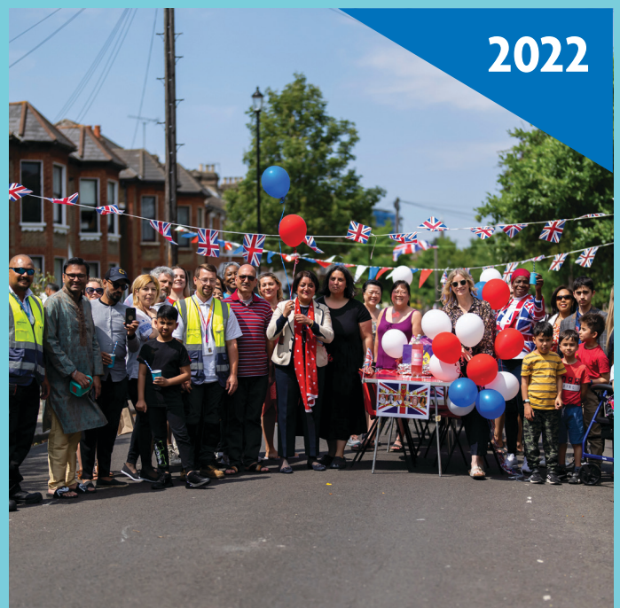
Above left: Lister Community School Above right: Mayor Fiaz at a Platinum Jubilee party