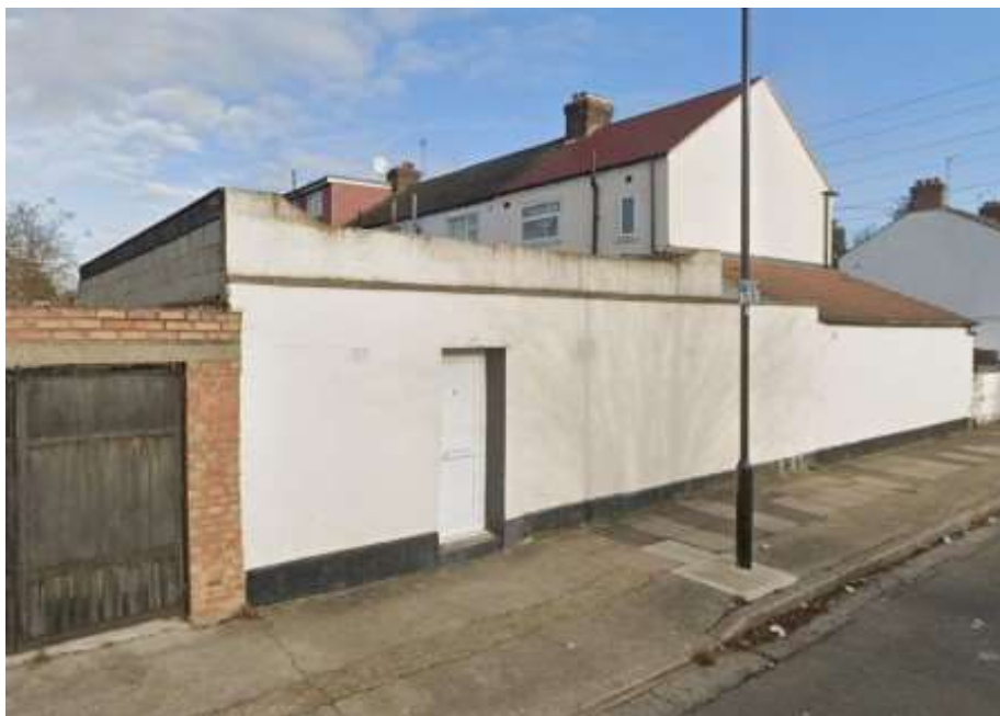
The image above shows the property with a poor EPC rating of G.

Find out more about the Minimum Energy Efficiency standards at https://www.newham.gov.uk/housing-homes-homelessness/minimum-energy-efficiency-standards-meets