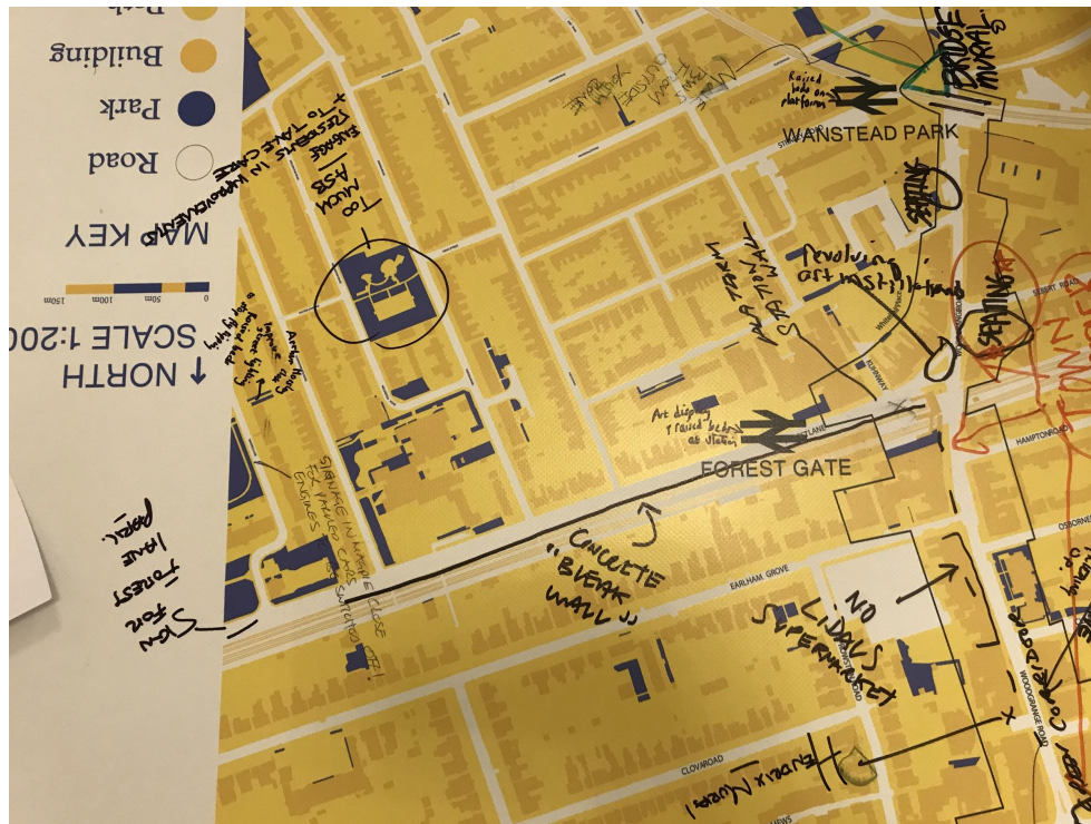
Manor Park Table 1