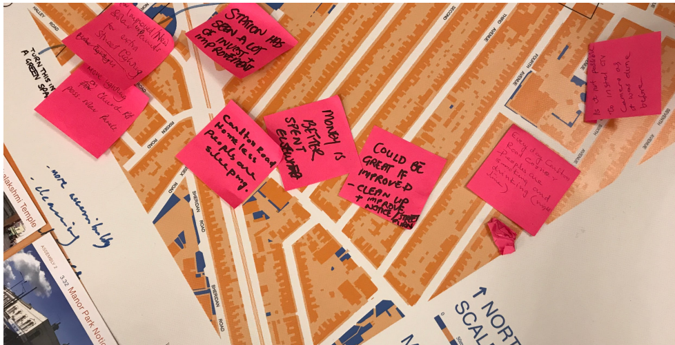
Little Ilford Table 1 + 2