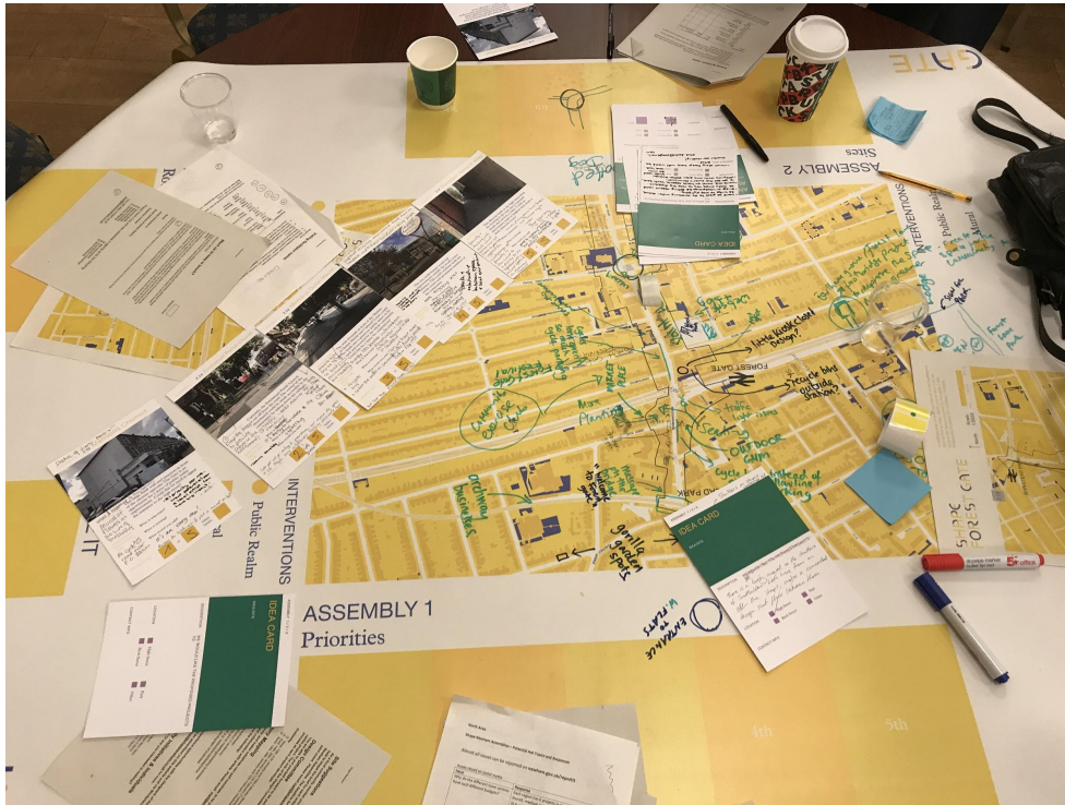
Forest Gate Table 2