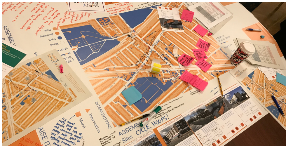
Manor Park Table 1