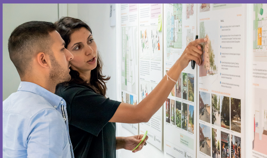
One of May's consultation events