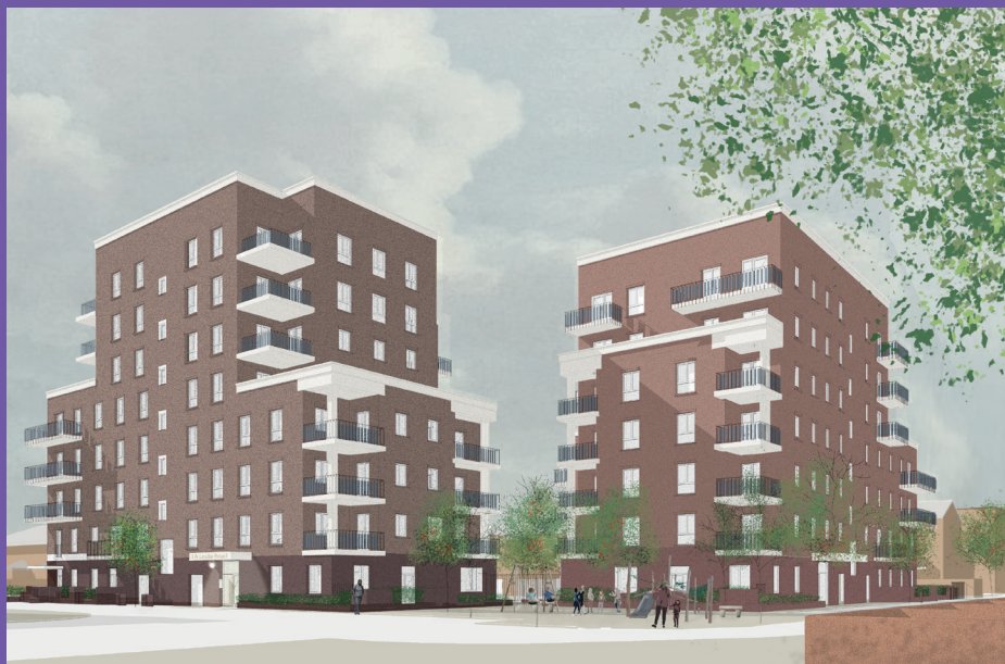
Sketch view of the neighbourhood squares looking north west from the end of Leslie Road

This decision by the Cabinet marks a key milestone for the regeneration of Custom House and signals the Council's