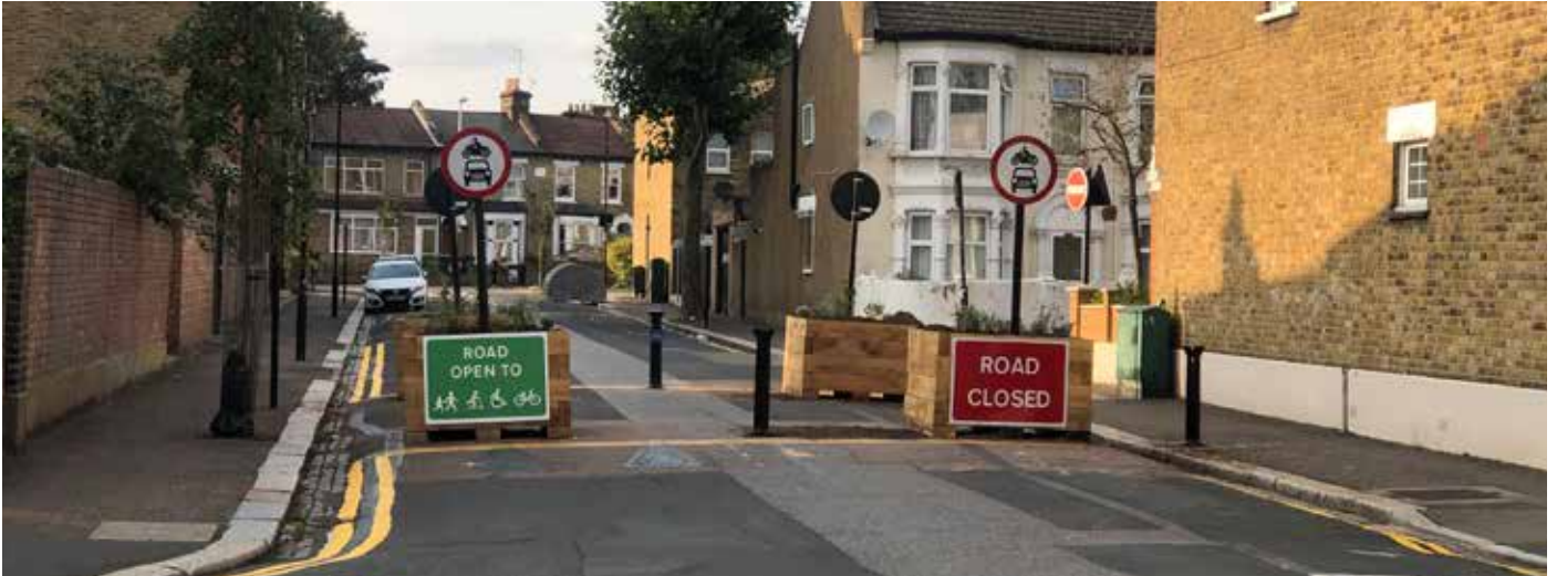
Modal filter on Blenheim Rd