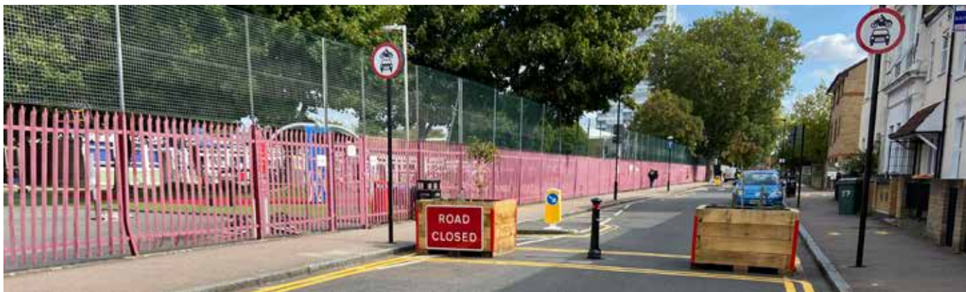
Modal filter on Maryland Rd, outside Colegrave Primary School