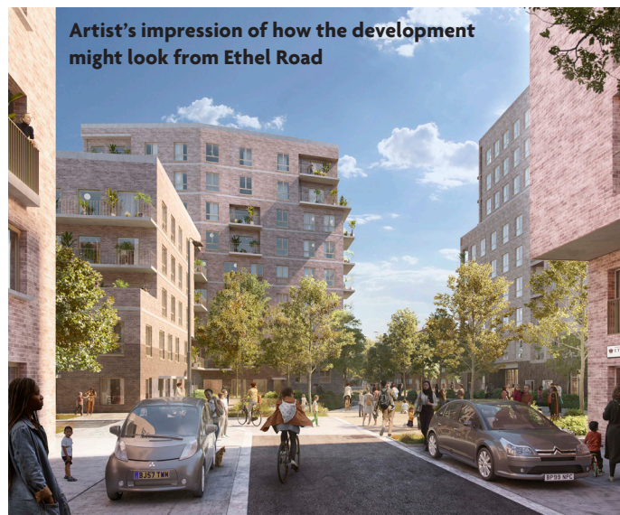
Artist's impression of how the development might look from Ethel Road

In consultation with the Greater London Authority (GLA), a review of the estate boundaries has also been carried out and a revised strategy for identifying potential ballot boundaries for individual estates agreed. This forms the basis of the kickstart site strategy where two sites, William Paton Gardens and 20-22 Freemasons Road, have been identified for early delivery as they will not require a ballot. These sites, together with Vandome Close, have been added to the Affordable Homes for Newham Programme; in June 2021 Cabinet approved the procurement of a housebuilder to deliver these projects.