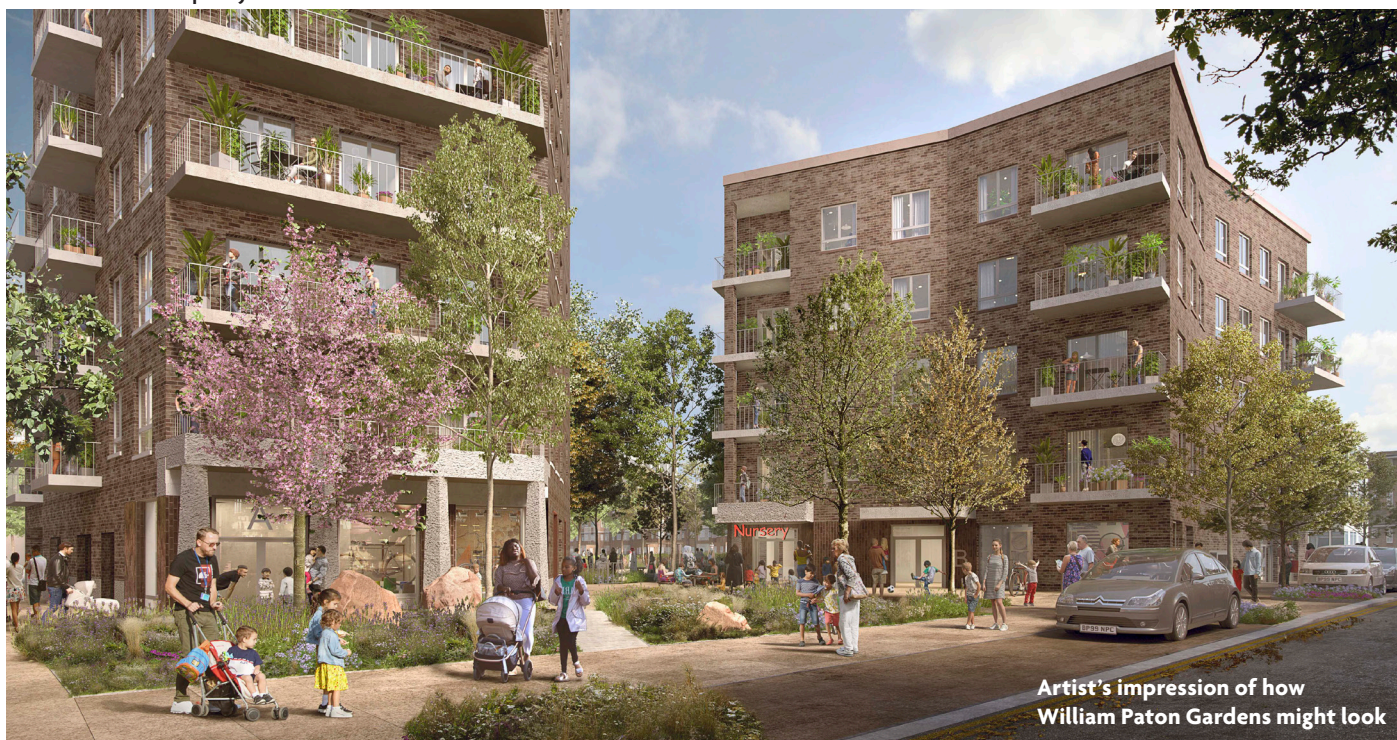
Artist's impression of how William Paton Gardens might look

Work is also underway to appoint two housebuilders to deliver these projects and it's expected the appointed contractors will start work on the planning applications in the new year.