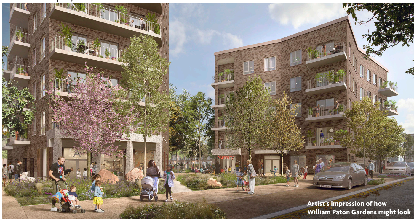
Artist's impression of how William Paton Gardens might look

Work is also underway to appoint two housebuilders to deliver these projects and it's expected the appointed contractors will start work on the planning applications in the new year.